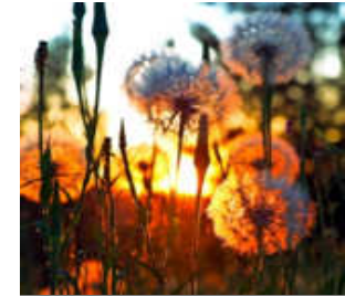
Biomass and waste